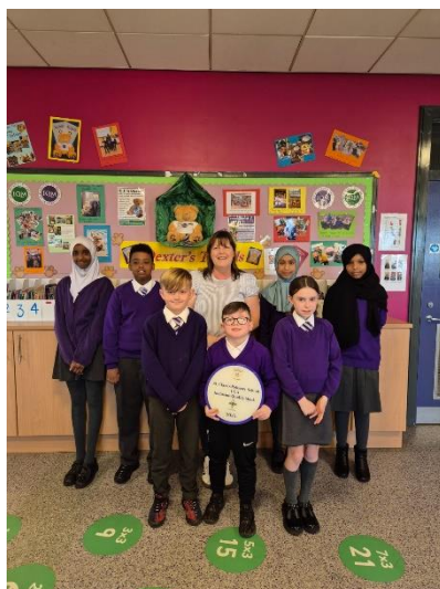
IFA Inclusion Award goes to St Clare's PS, Belfast