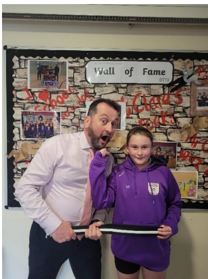
Our latest successful athlete obtaining her Black Belt